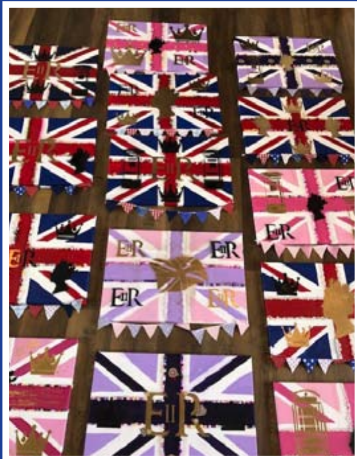
Year 5 Mixed Media canvases based on the Platinum Jubilee